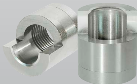
Weld-in sleeve LZE